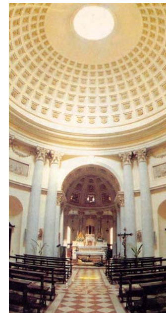
Schio, the Church of the Canossian House. Under the altar, rest, in a precious urn, Bakhita’s mortal remains.

On May 17, 1992, Josephine Bakhita was beatified by Pope John Paul II. She was proclaimed Saint on October 1, in the Jubilee year 2000.